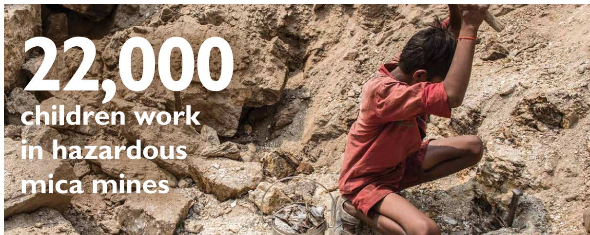
Photo: A child who should be attending school instead spends his entire day breaking off mica flakes, which will add glitter to cosmetics.

Most Canadians are unaware that incandescent makeup usually contains mica – a mined mineral often linked to child labour and human suffering. That eye colour palette or highlighter may give a Hollywood glow, but further down the supply chain there's a chance that children as young as five years old are risking their childhood, the hope for education, and even their lives to mine this raw material.